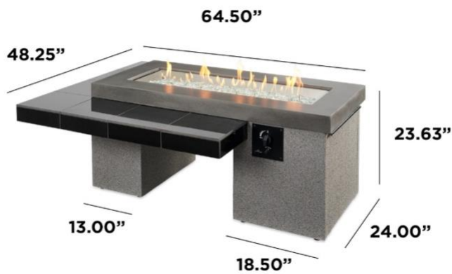
UPT-1242 445 LBS