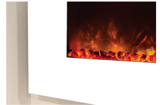
Powder Coated White Glass