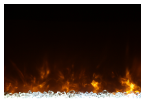
Glacier Diamond Glass with Orange Flame