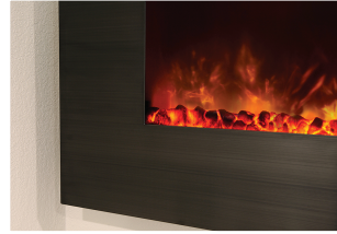
Black Stainless Steel