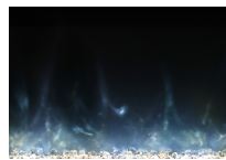
Glacier Diamond Glass with Blue Flame