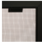
Safety Screen Barrier