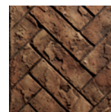
Herringbone Brick Liner RLH