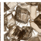
Ember Glass Bronze