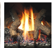
LOGF35/LOGF36 Fibre Split Oak