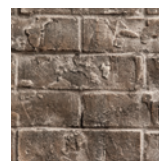
Traditional Brick Liner RLT